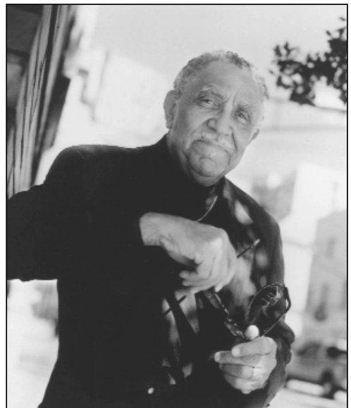
Dr. Joseph E. Lowery

Dr. Joseph Lowery is a national treasure that has fought over the decades for our civil rights, way before many of us knew we had any. He continues to be the voice of freedom and wisdom around the country and in our communities. Ebony Magazine named Dr. Lowery as one of the nation’s “15 Greatest Black Preachers”! He was described as, “the consummate voice of biblical social relevancy, focused prophetic voice, speaking truth to power.” At the 1997 NAACP Convention, Dr. Lowery was hailed as “The Dean Of The Civil Right’s Movement”.