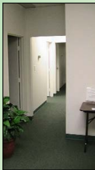
Hallway To Opportunity