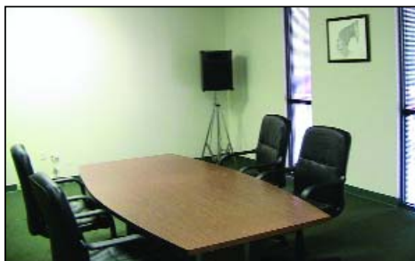
Main Conference Room / Seating Capacity Thirty