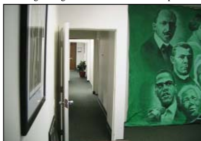
Hallway To Opportunity

inside of your church, within other churches and throughout the community.