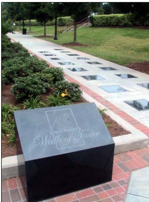
Civil Rights Walk Of Fame

We are letting everyone know that justice is not a Black issue. Poverty is not a Black issue. There are poor white folks as well. We must work together for the good of all God’s children. Many people died for us to have a right to vote; yet many don’t exercise it. This is one of the reasons why we end up with the leaders that we do. Our votes do count! My future is already in my past. Your future is still ahead. You need to be an agitator of public policy.” So vote! You’ll feel good!