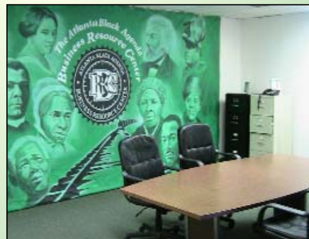
Main Conference Room / Seating Capacity Thirty