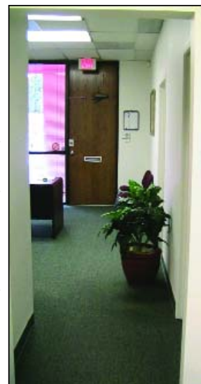
Hallway To Opportunity

The Conductor, the quarterly newspaper of the BRC, has grown from 4 to 16 pages. Churches, businesses and affiliates are realizing that the Conductor is an effective means of reaching the community. The pastors of the church centers should be commended for their forward thinking. If your church is a BRC center, thank your Pastor. If it is not, let your pastor know of this powerful and growing movement which will help consumers know of your business